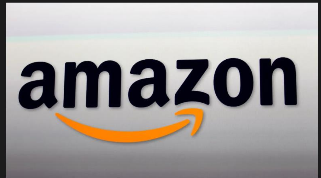
FILE – The Amazon logo is displayed, Sept. 6, 2012, in Santa Monica, Calif. Amazon's profitable cloud business will invest roughly $7.8 billion ...

by: Kassidy Hammond Posted: Sep 4, 2023 / 11:34 AM EDT Updated: Sep 4, 2023 / 11:46 AM EDT